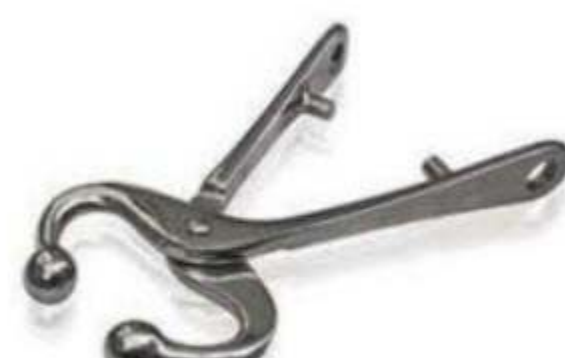
Bull Holder Product No.: ASV-078