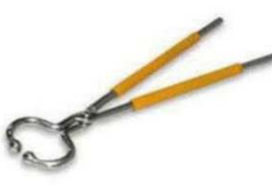
Bull Holder, Rubber Grips Product No.: Art# 086