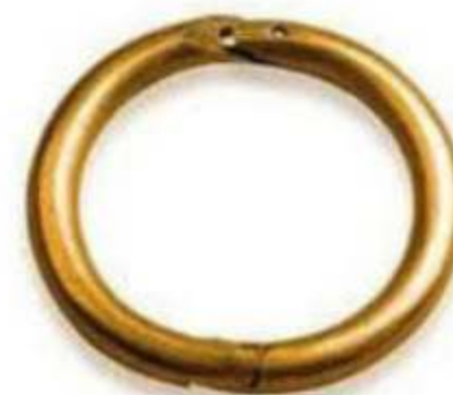
Bull Nose Ring (Brass) Product No.: Art# 095