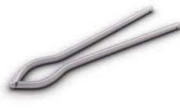
Nose Twitch For Horses Product No.: ASV-083