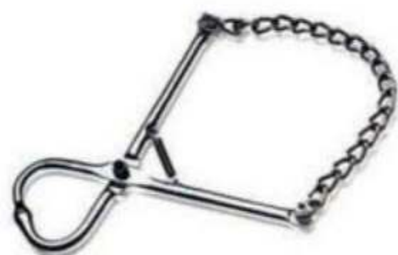
Bull Holder With Chain Product No.: ASV-080