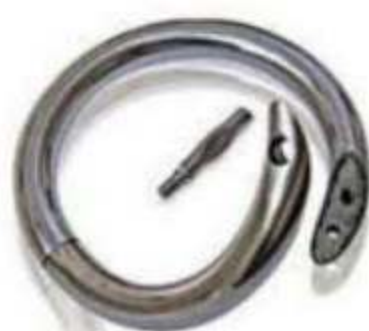
Bull Nose Ring S.S. (Routing) Product No.: Art# 094