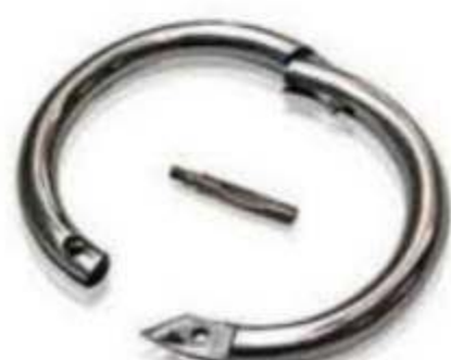
Bull Nose Ring (Steel) Product No.: Art# 092