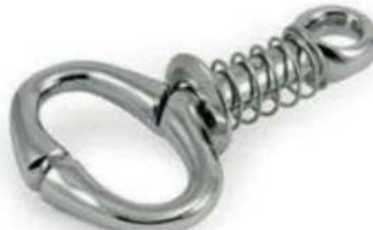
Bull Holder With Spring, (Small) Product No.: Art# 074