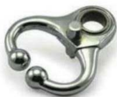
Bull Holder Product No.: Art# 072