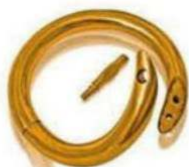
Bull Nose Ring Copper (Routing) Product No.: Art# 093