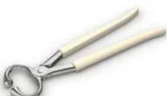
Bull Holder with Rubber Grip Product No.: ASV-077