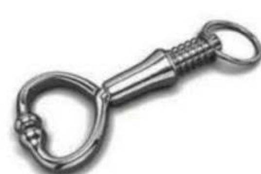
Bull Holder, Coiled Spring Product No.: Art# 089