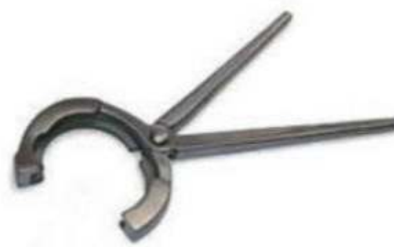
Bull Ring Applicator Product No.: ASV-082