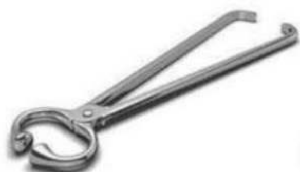
Steel Bull Holder Product No.: ASV-076