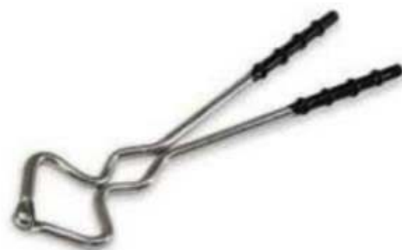
Bull Holder, Tong Pattern Product No.: Art# 088