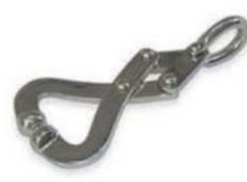
Bull Holder Product No.: Art# 090