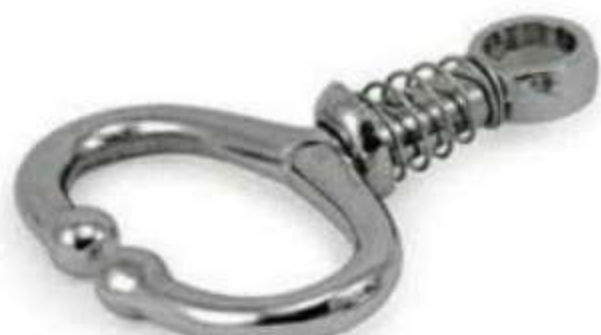
Bull Holder With Spring, (Large) Product No.: Art# 073