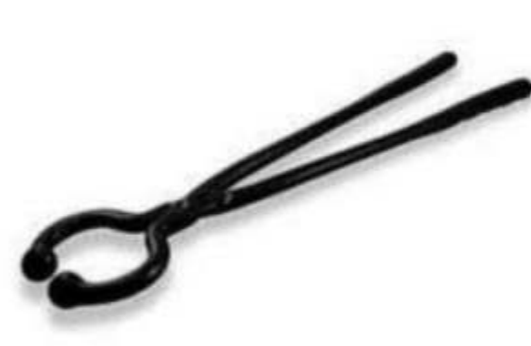
Bull Holder, Blod Black Product No.: Art# 087