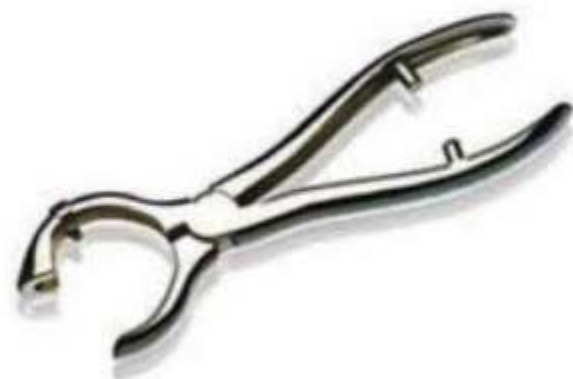
Bull Nose Ring Applicator Product No.: ASV-081