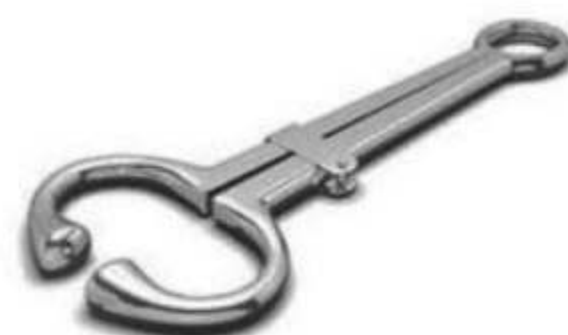
Harms Bull Holder with Slide Adjuster Product No.: Art# 075