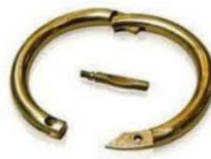
Bull Nose Ring (Brass) Product No.: Art# 091