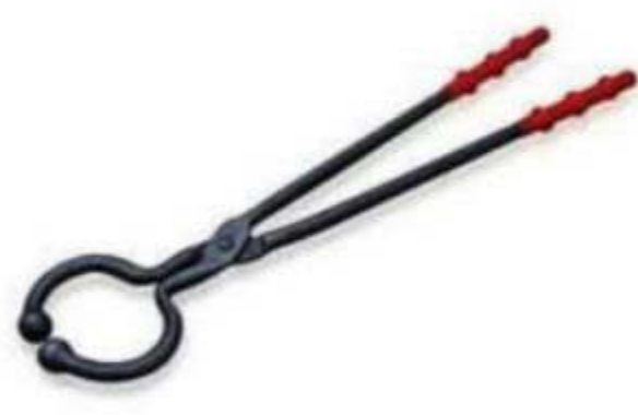
Bull Nose Holder Product No.: Art# 085