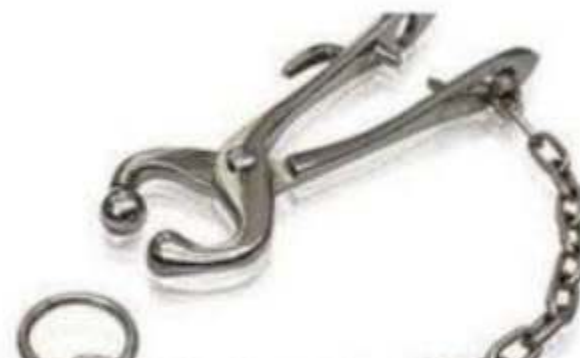
Bull Holder with Steel Chain Having Hook Product No.: ASV-079