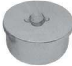
MSI-10927-00 Ounces 40