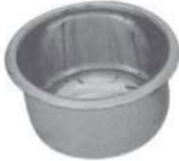
MSI-10926-00 Ounces 10, 20, 40, 60, 80