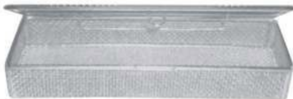
MSI-10895-00 Instruments Tray Dimension 230x80x40mm