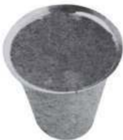
MSI-10930-01 50 cc MSI-10930-02 100 cc Medicine Cup