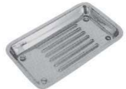
MSI-10907-00 Scaler Tray 200 x 100 x 15 mm 200 x 150 x 15 mm