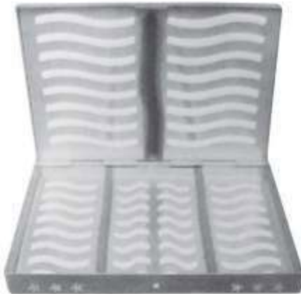
MSI-10890-00 Made of Stainless Steel Silicone Instruments Holder Medium Cassette for 10 instruments Silicone is Available in Assorted colors. Dimension 188x135x22mm