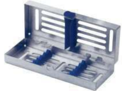
MSI-10884-05 Instruments Cassette Removable cover, Twist lock system 5 Instruments