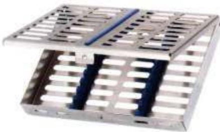
MSI-10885-10 Instruments Cassette 10 Instruments