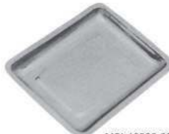
MSI-10906-00 Instruments Tray Shallow Mayo 8" x 6" x 1" 9" x 6" x 1" 12" x 8" x 2"