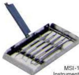
MSI-10886-05 Instruments Cassette 05 Instruments