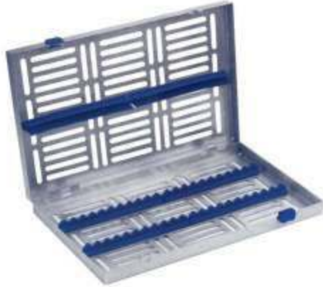
MSI-10881-20 Instruments Cassette Removable cover, Twist lock system 20 Instruments

Plateaux d'instruments Plateaux d'instruments