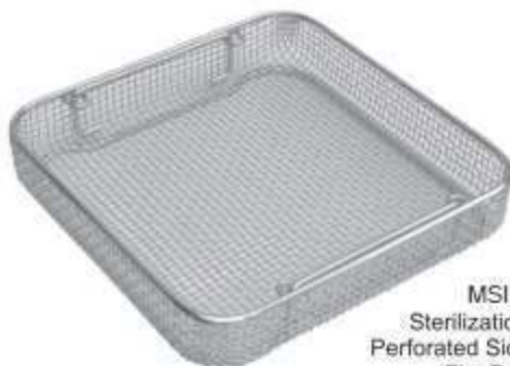
MSI-10897-00 Sterilization Basket with Perforated Sides Crosshatched Flat Based Mesh without Lid Dimension 250x235x50mm