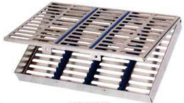
MSI-10887-20 Instruments Cassette 20 Instruments