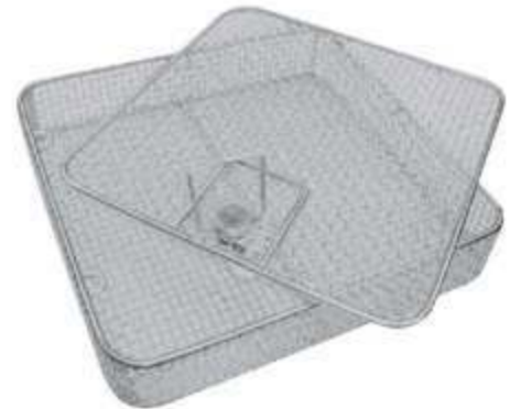
MSI-10896-00 Sterilization Basket with Cross-hatched Flat based Mesh, Lockable & Removable Dimension 240x250x57mm