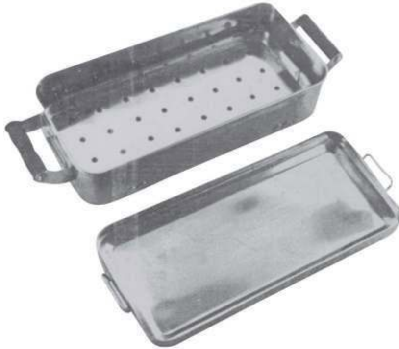
MSI-10916-00 27 x 12 x 6 cm Sterilizer With Heater

Sterilisation & Dressing Instruments stérilisation et habiller instruments Sterilizing & Dressing Instruments esterilización y vestirse instrumentos