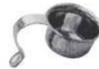
MSI-10912-00 Finger Cup