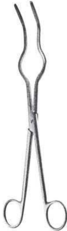
MSI-10877-24 24 cm Ulival