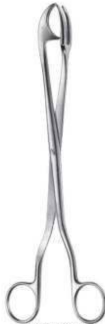
MSI-10874-23 Rogge 23 cm