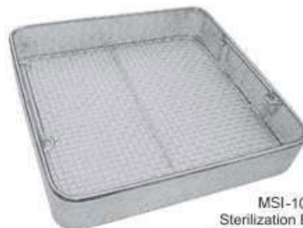
MSI-10898-00 Sterilization Basket with Cross-hatched Flat based Mesh, Lockable & Removable Dimension 255x228x55mm