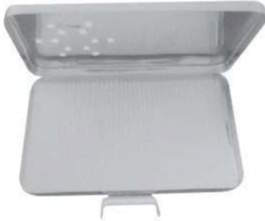
MSI-10888-00 Stainless Steel Sterilizing Box includes a Finger tip silicone Mat insert to facilitate sterilization of handpieces. Perforated top made of stainless dimension 255x155x20mm

Instrument Plateaux & Basket Instrumento Bandejas y cesta