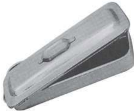
U25-10908-00 Catheter Tray 222 x 82 x 40 mm 225 x 125 x 50 mm 325 x 90 x 50 mm