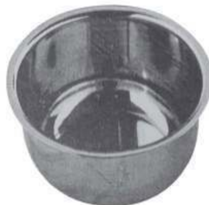
MSI-10931-00 80 x 50 mm Iodine Cup