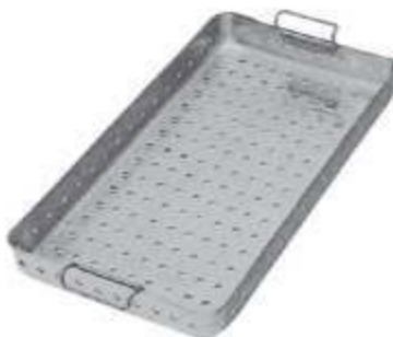
MSI-10905-00 Instruments Tray Perforated 12" x 6" x 1"