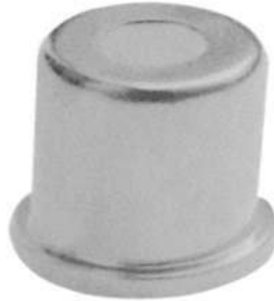
MSI-10932-00 Cotton Wool Holder