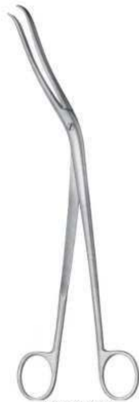
MSI-10873-27 Cheatle 27 cm