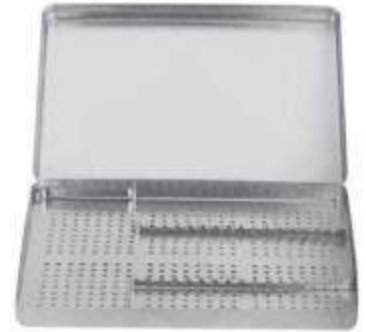
MSI-10901-00 Perforated Tray 288 x 187 x 40 mm 180 x 140 x 40 mm