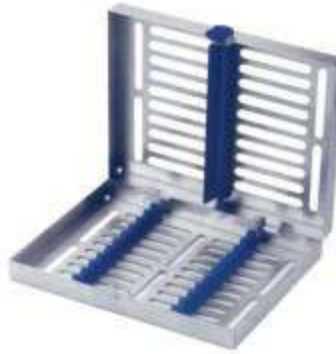
MSI-10882-10 Instruments Cassette Removable cover, Twist lock system 10 Instruments