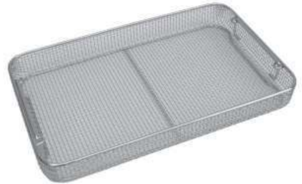
MSI-10894-00 Instruments Tray Dimension 240x130x50mm