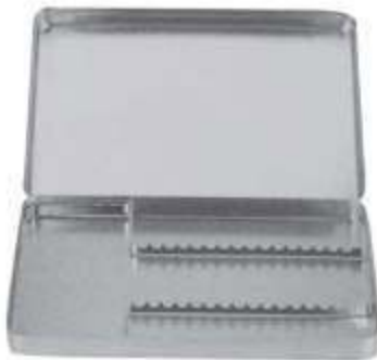
MSI-10902-00 Perforated Tray 288 x 187 x 40 mm 180 x 140 x 40 mm