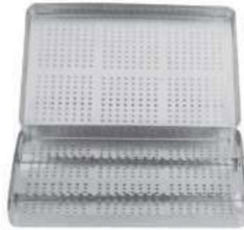
MSI-10900-00 Perforated Tray 288 x 187 x 40 mm 180 x 140 x 40 mm