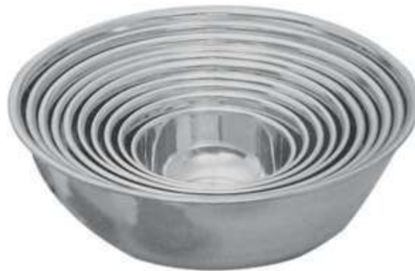
MSI-10929-10 10 cm MSI-10929-12 12 cm MSI-10929-15 15 cm MSI-10929-20 20 cm MSI-10929-25 25 cm Lotion Bowl