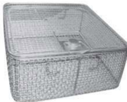
MSI-10892-00 Sterilization Basket with Cross-hatched Flat Based Mesh, Lockable & Removable lid. Dimension 240x250x107mm