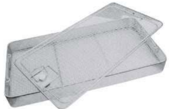
MSI-10891-00 Sterilization Basket with Cross-hatched Flat Based Mesh, Lockable & removable Dimension 480x228x55mm