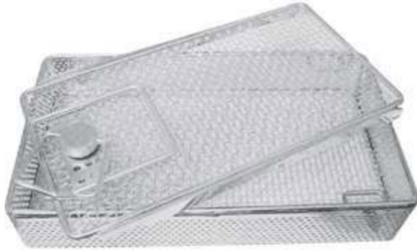
MSI-10893-00 The Base is Crimped wire Mesh with opening Mesh cross-hatched flat Based Mesh and Perforated sides and removable lid Dimension 220x125x40mm