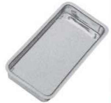
MSI-10904-00 Instruments Tray 8" x 4" x 1"