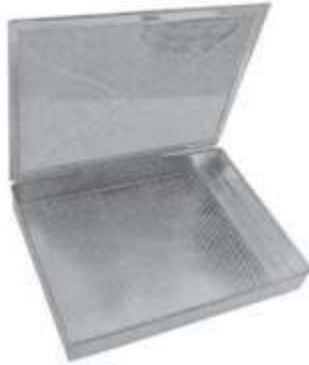
MSI-10899-00 Solid Sides, Perforated Base & Top is crimped Wire Mesh with top opening Dimension

Instrument Plateaux & Basket Instrumento Bandejas y cesta