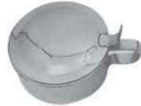
MSI-10928-00 Spitten Mug