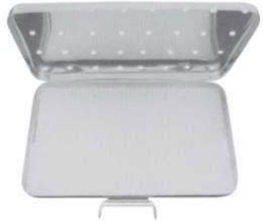
MSI-10889-00 Stainless Steel Sterilizing Box includes a Finger tip silicone Mat insert to facilitate sterilization of handpieces. Perforated top made of stainless dimension 255x155x20mm