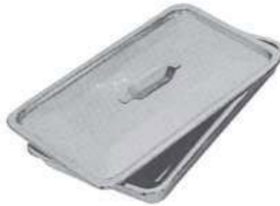
MSI-10903-00 Instruments Tray & Cover 8" x 6" x 2" 10" x 8" x 2" 12" x 7" x 2"