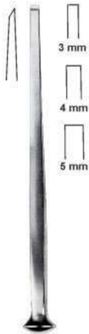
Alexander 17 1/2 cm