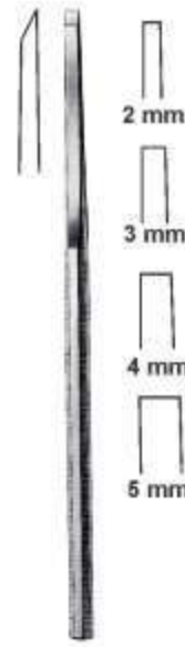
Bishop 15 cm