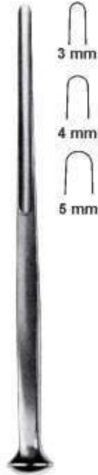
Alexander 17 1/2 cm