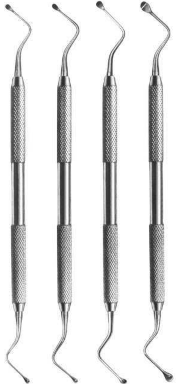
MSI-1617-01 Lucas Fig. 1