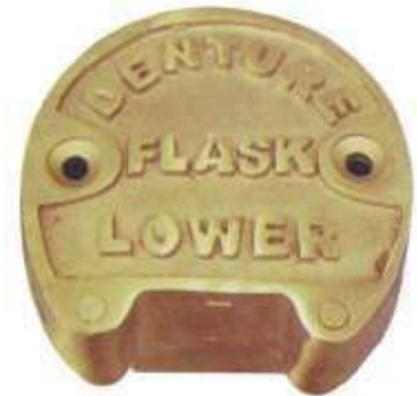
MSI-2240-00 Lower Denture Flask forged Brass Alloy construction. Fitted with Hardened stainless steel Alloy rear Tapered guide pins. Dimension: 4" Long x 3 3/4" wide x 2 1/4" High (10cm x 10cm x 6cm) & weight: 0.920kg