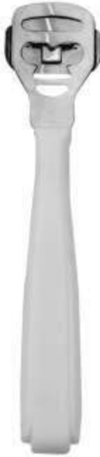
MSI-2249-02 Corn Cutter - Plastic Handle