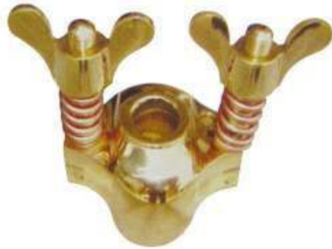
MSI-2234-00 Crown Flask for Dental Tooth, Forged Brass Alloy construction Unit weight: 365 gram