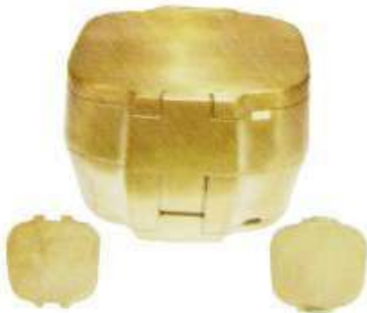
MSI-2238-00 Square Dental Alloy Flask, Pressure Die Casted, made of brass Dimension: 7.2 x 8.4 x 5.0 cm Unit weight 1.300kg