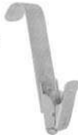
MSI-2264-00 Radiography Clip