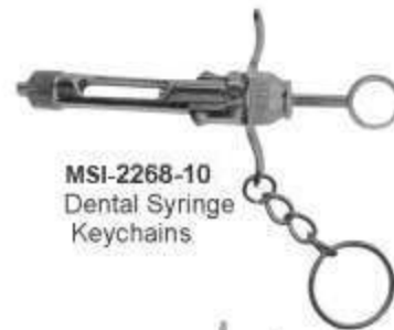
MSI-2268-10 Dental Syringe Keychains