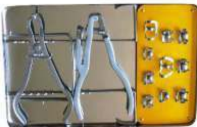
MSI-2269-03 Rubber Dam Set