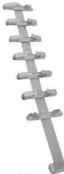
MSI-2265-00 X-Ray Film hangers Multiple Clips Available in 6, 8, 10, 12, & 14 Clips