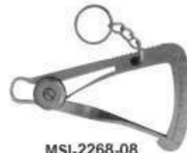
MSI-2268-08 Dental Caliper Keychains