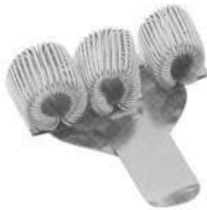
MSI-2252-00 Pocket Instruments Holder