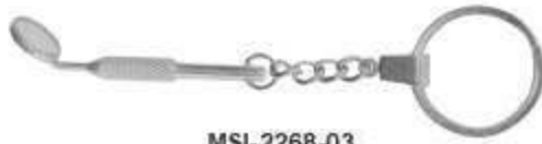
MSI-2268-03 Mouth Mirror Keychains