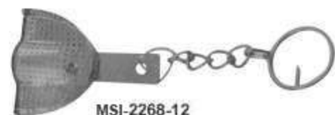
MSI-2268-12 Impression Tray Keychains