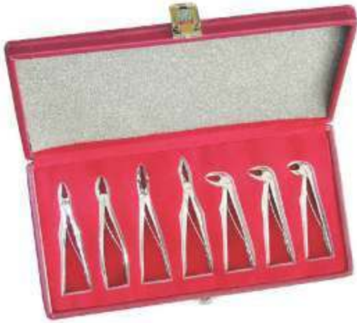
MSI-2269-01 Dental Forceps Set Childs