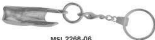
MSI-2268-06 Dental Tooth Keychains