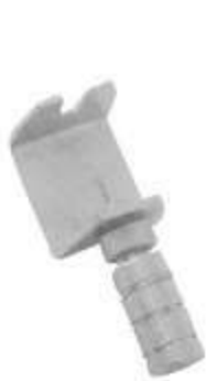
MSI-2250-00 Universal Bur Changer Wrench