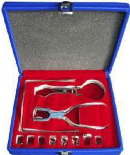
MSI-2269-02 Rubber Dam Set