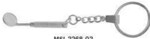
MSI-2268-02 Mouth Mirror Keychains