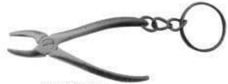
MSI-2268-07 Extracting Forceps Keychains