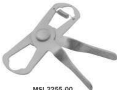
MSI-2255-00 Caliper Eight Gauge