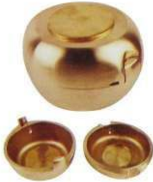
MSI-2233-00 Round Denture Flask are made in superior Gunmetal & Brass The round Flasks are Appropriate Dimension: 4" x 4 1/2" x 2 1/2" and Weight 1.100kg