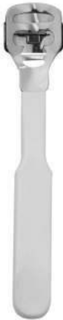
MSI-2249-03 Corn Cutter - Plastic Handle