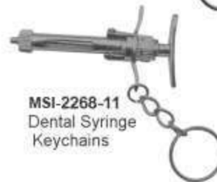
MSI-2268-11 Dental Syringe Keychains