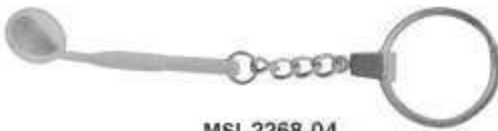
MSI-2268-04 Mouth Mirror Keychains