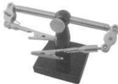
MSI-2256-00 Optical Inspection stand