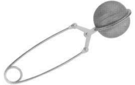
MSI-2261-00 Mesh Bur Holder