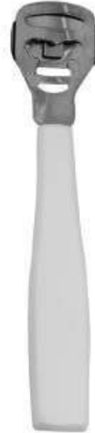
MSI-2249-04 Corn Cutter - Plastic Handle