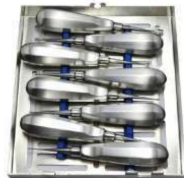
MSI-2269-07 Root Elevator Set