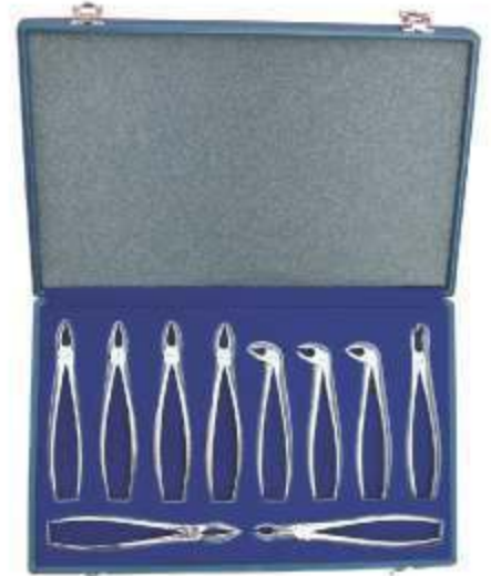
MSI-2269-04 Dental Forceps Set