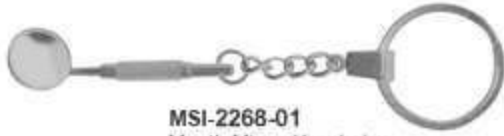
MSI-2268-01 Mouth Mirror Keychains