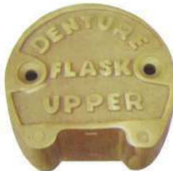
MSI-2239-00 Upper Denture Flask forged Brass Alloy construction Fitted with Hardened stainless steel Alloy rear Tapered guide pin: Dimension: 4" Long x 3 3/4" wide x 2 1/4" High (10cm x 10cm x 6cm) & weight: 0.920kg