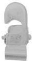
MSI-2263-00 X-Ray Film Holder