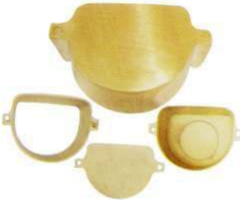
MSI-2235-00 One Side Flat Brass Flask, New Shape forged brass Alloy construction, Dimension: 2 1/4" x 3 1/2" x 4 3/4" & Unit weight 955 gram