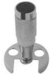
MSI-2254-00 Diamond Disc Guard with adapter