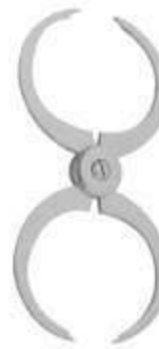
MSI-2253-00 Bow Caliper 8 (compasse)