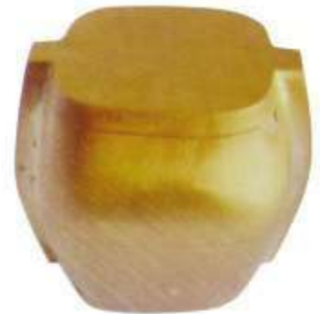
MSI-2237-00 Forged Brass Toothed Dental Alloy Flask for Single tooth, Dimension: 5.0 x 5.0 x 4.0cm & Unit weight 270gram