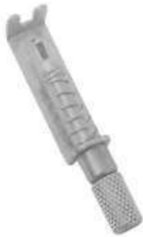
MSI-2251-00 Dentaire Bur Changer wrench