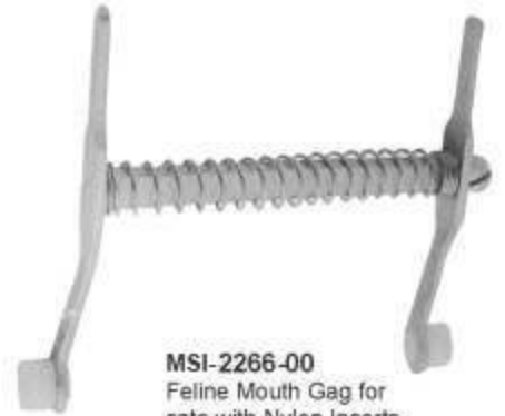
MSI-2266-00 Feline Mouth Gag for cats with Nylon Inserts Available in 2 sizes Small 2.5" Large 3"