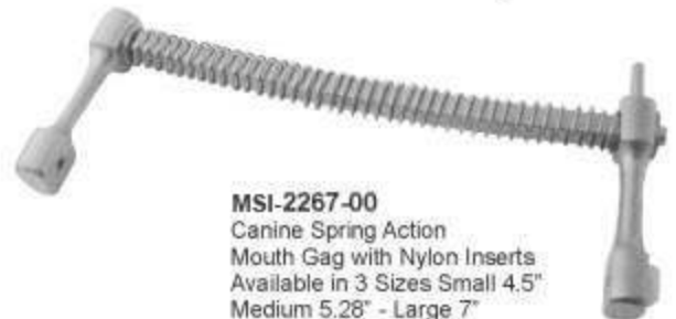
MSI-2267-00 Canine Spring Action Mouth Gag with Nylon Inserts Available in 3 Sizes Small 4.5" Medium 5.28" - Large 7"