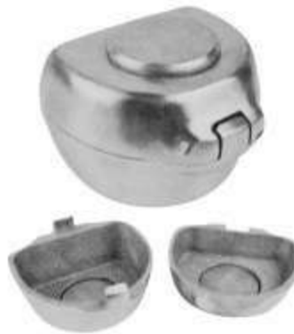
MSI-2236-00 Mortimer Silverline Alloy Flask, Forged Silver Alloy construction, Dimension: 4 1/4" Long x 4" Wide x 2 3/4" High (11 x 10 x 7cm) Unit weight = 750 gram