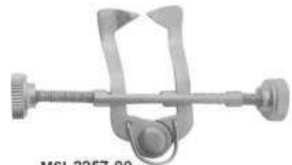
MSI-2257-00 Matrix Retainer Elliott Separator