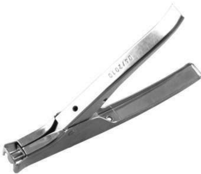
MSI-2247-00 Gic Applicator