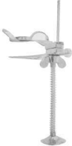
MSI-2259-00 Tongue Depressor Small, Large