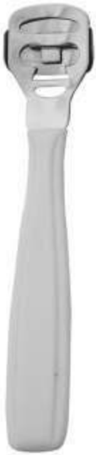
MSI-2249-01 Corn Cutter