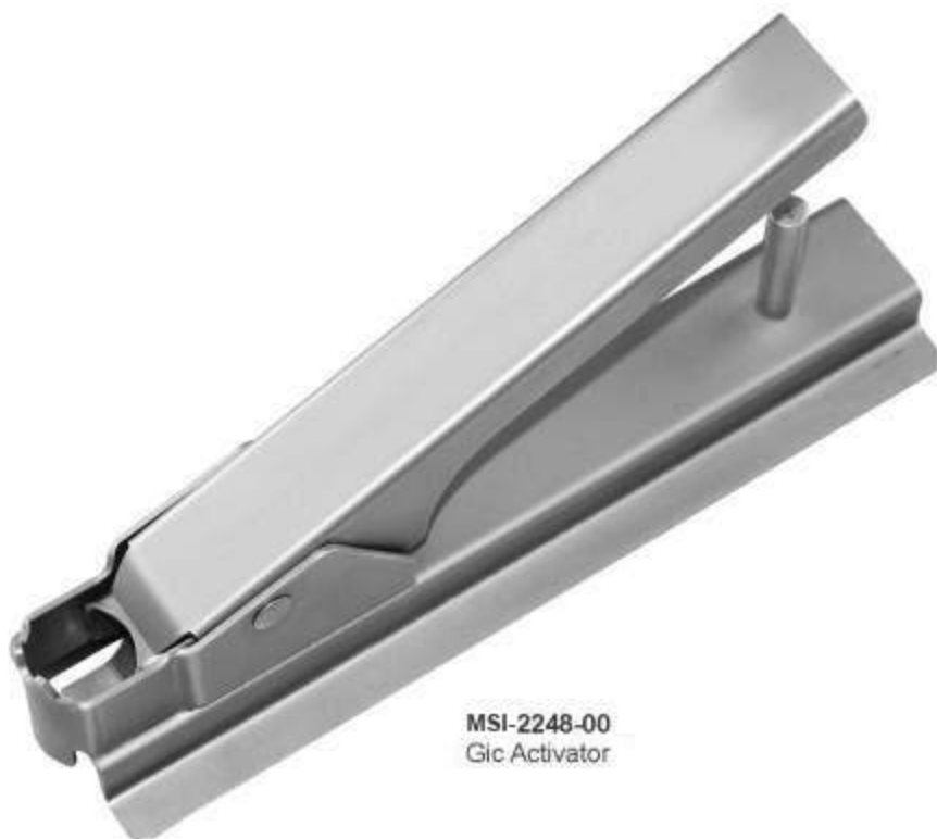
MSI-2248-00 Gic Activator