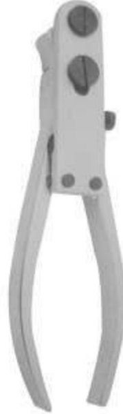
MSI-2260-00 Ring Bending Pliers Swiss Model 190 mm