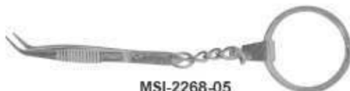
MSI-2268-05 Tweezer Keychains