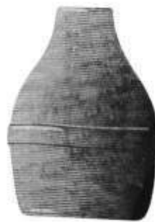
MSI-1746-02 with Valve