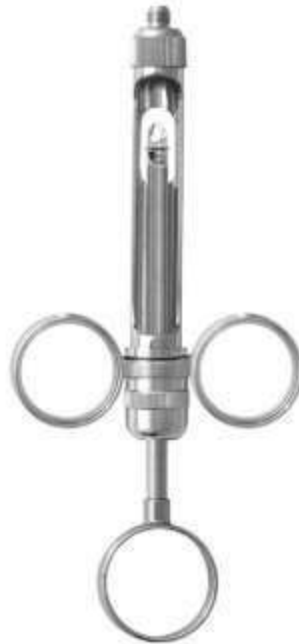
MSI-1743-15 Articulated Syringe S-Type Arpon Bayer for Anesthesia Non folding. chromium Plated Brass. Available in Us / Metric Threads