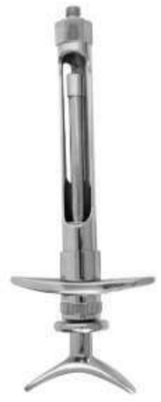
MSI-1743-17 Standard Syringe 1.8 ml 2.2 ml