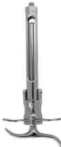
MSI-1743-16 Aspirating Folding Cartridge Syringe. chromium Plated Brass. 1.8 CC & 2.2 CC Available in Us/ Metric Thread