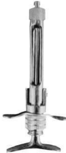
MSI-1743-12 Flat Wing Cartridge Syringe for Anesthesia, folding type. Cylinder without Aspiration Metric / Us Thread - 1.8 CC & 2.2 CC