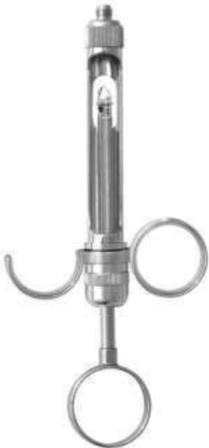
MSI-1743-14 3 Ring Cartridge Syringe for Anesthesia - Non-Folding type Available in Us / Metric Threads