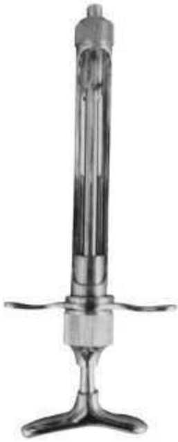
MSI-1743-10 Flat Wing Non-Folding Type Anesthesia syringe. Cylinder without Aspiration Metric / Us Thread - 1.8 CC & 2.2 CC

Available in European and American Both Threads