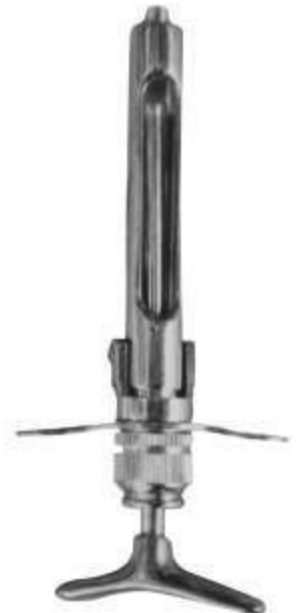
MSI-1743-13 Flat Wing Folding Type Anesthesia syringe. Cylinder without Aspiration Metric / Us Thread. chromium plated Brass. - 1.8 CC & 2.2 CC