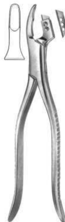
MSI-1742-07 Crown Slitter Montfort 180 mm, 7"