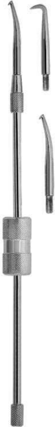
MSI-1724-02 Crown Remover Complete with 2 points