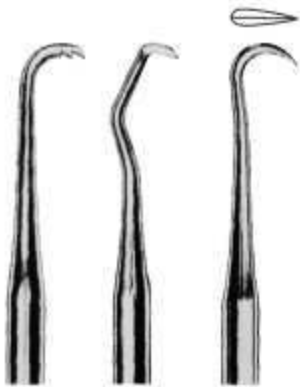
MSI-1717-01 MSI-1717-01 MSI-1717-01