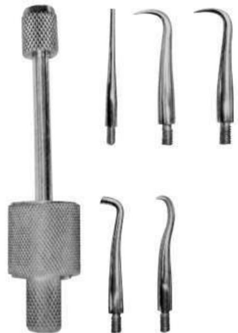
MSI-1723-05 Morrel Crown Remover (Manual) Double ended with 5 attachments stainless steel