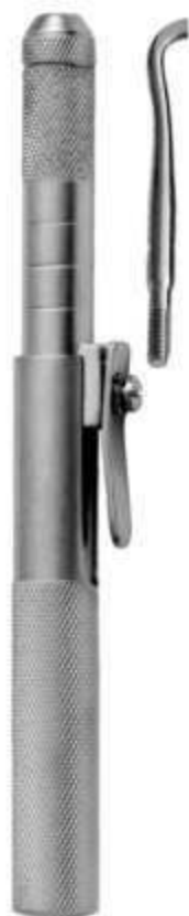
MSI-1731-03 Crown Remover Complete with 3 points