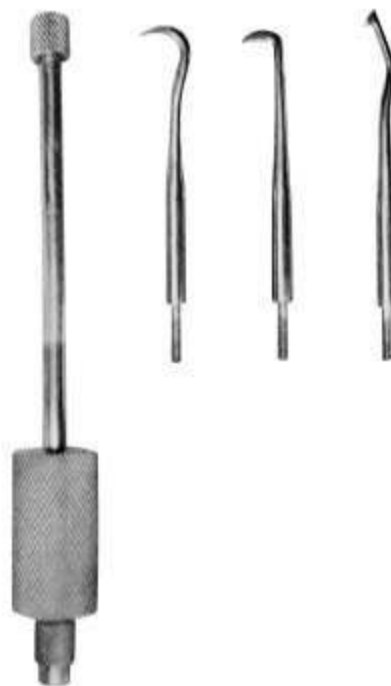
MSI-1722-03 Morrel Crown Remover (Manual) Double ended with 3 attachments stainless steel