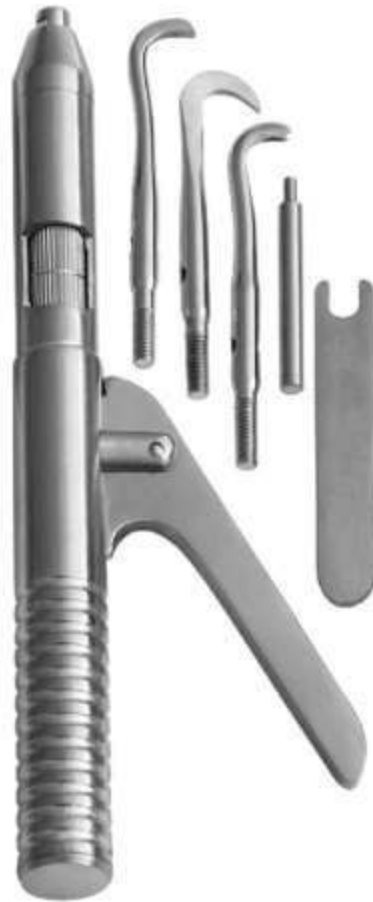
MSI-1726-03 Crown Remover Complete with 3 points