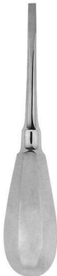
MSI-1734-00 Fig. 0