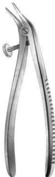
MSI-1737-01 Telescope Crown Plier 140 mm, 6"