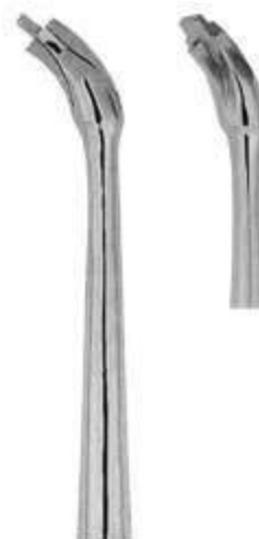
MSI-1734-03 Fig. 3 Universal