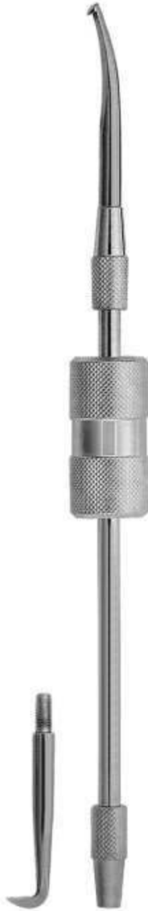
MSI-1725-02 Crown and bridges remover with 2 points