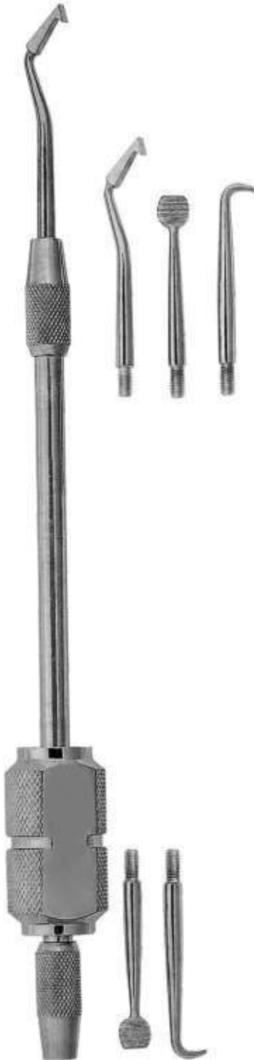
MSI-1720-05 Morrel Crown Remover (Manual) Double ended with 5 attachments stainless steel