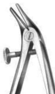
MSI-1737-02 Telescope Crown Plier 140 mm, 6"