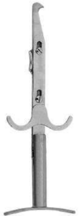
MSI-1730-00 Crown Spreader, Crown Remover, Special instrument for crown spreading after separating, simple and safe operation