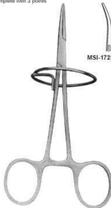
MSI-1728-00 Crown & Bridge Forceps with support Ring