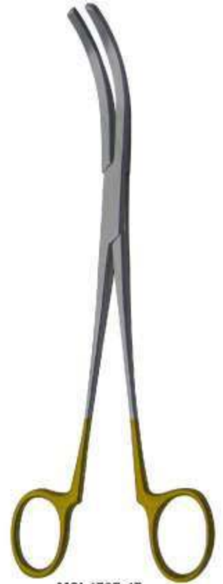
MSI-1727-17 Crown Remover Forceps 17 cm