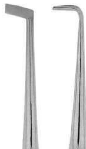
MSI-1734-01 MSI-1734-02 Fig. 1 Fig. 2