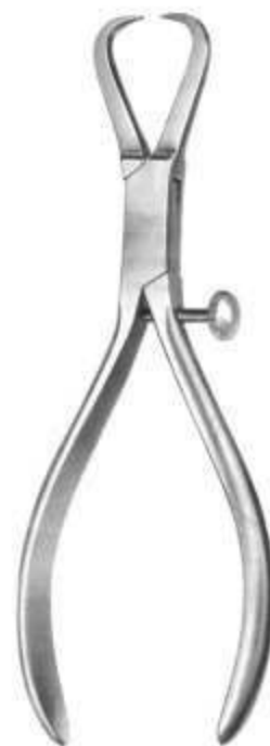
MSI-1738-00 Cooper ring remover plier Furrer 150 mm