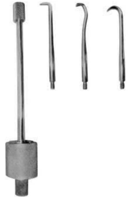
MSI-1721-03 Morrel Crown Remover (Manual) Double ended with 3 attachments stainless steel