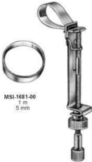
MSI-1681-00 1 m 5 mm

Matrizenspanner inklusive Matrizenband Matrix retainer and matrix bands