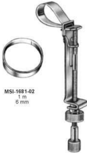
MSI-1681-02 1 m 6 mm