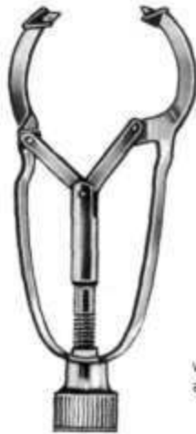
MSI-1683-02 Ivory Fig. 12