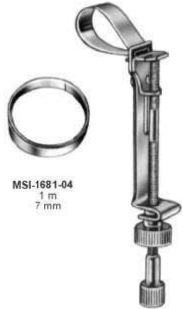
MSI-1681-04 1 m 7 mm